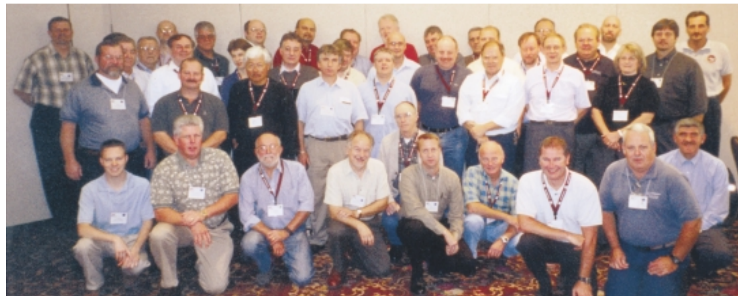
A rare event indeed is captured by this photograph, that is, the auditors, staff and the Task Group members all together in one place at one time. This photo was taken at the October 2003 Auditor Training Session held in Pittsburgh Pennsylvania.