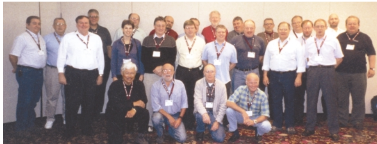
PRI gathered the NDT auditors from literally all over the world to take this photo. As you can see, the auditors do smile, at least when they are having their photograph taken.